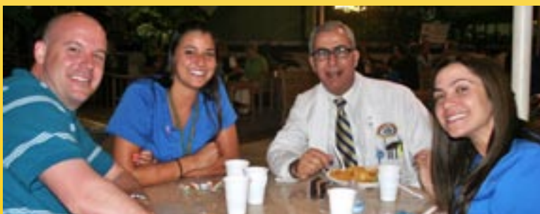
Eye Bank staff members enjoy the reception.