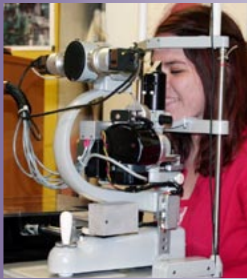
Remote slit lamp microscope is demonstrated.