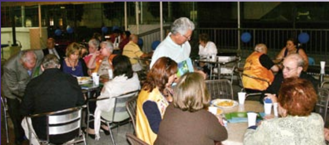
Lions relax after the tours.