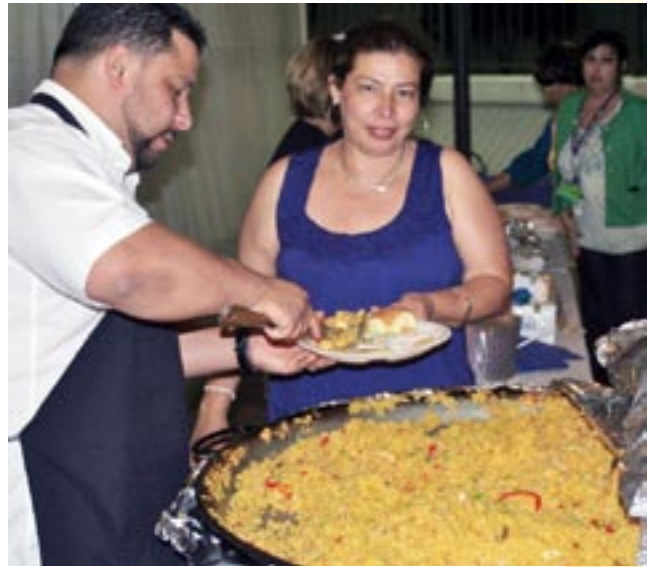
Paella was on the menu after the tours.

After the tours, the groups met back at the Retter Patio for fellowship and a festive paella dinner. Attendees left with information packets and a better understanding of how their support assist the sight-saving work of the eye bank.