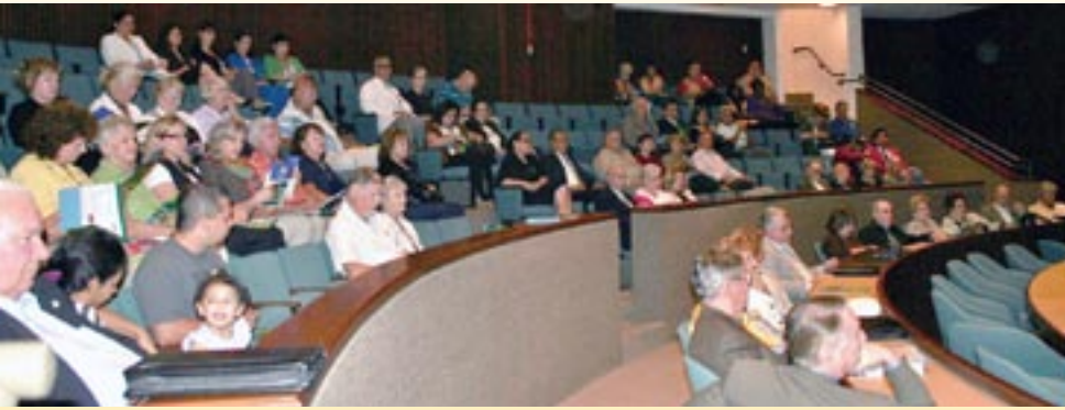
Many enjoyed the presentations inside the Retter Auditorium