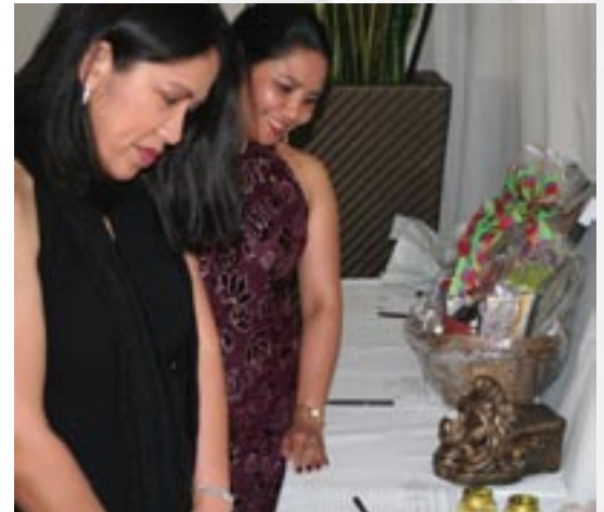
Guests consider the array of silent auction items.