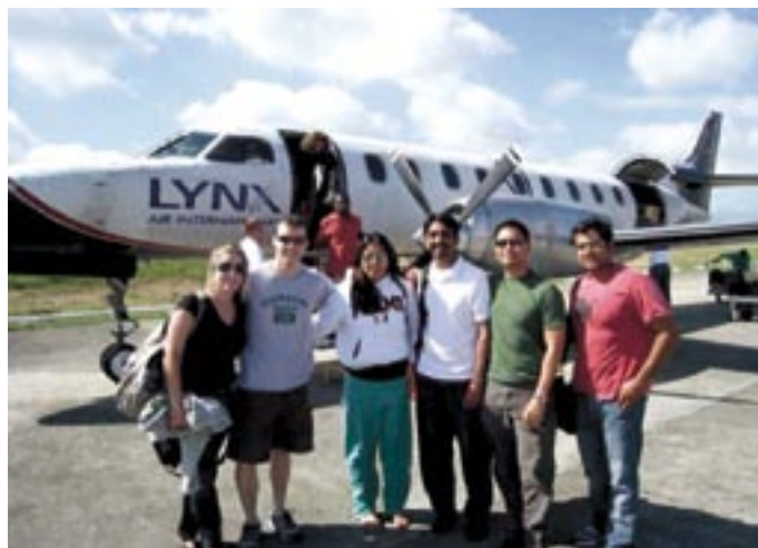
Along with the medical professionals, the flight to Haiti carried a precious cargo: scleral tissue donated by the Florida Lions Eye Bank.