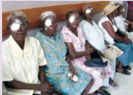
(Above) Four of the doctors spent much of their time in the operating room performing 59 cataract and 20 glaucoma surgeries. Patients are shown post-op at left. The volunteer doctors also concentrated on teaching the Haitian ophthalmologists.